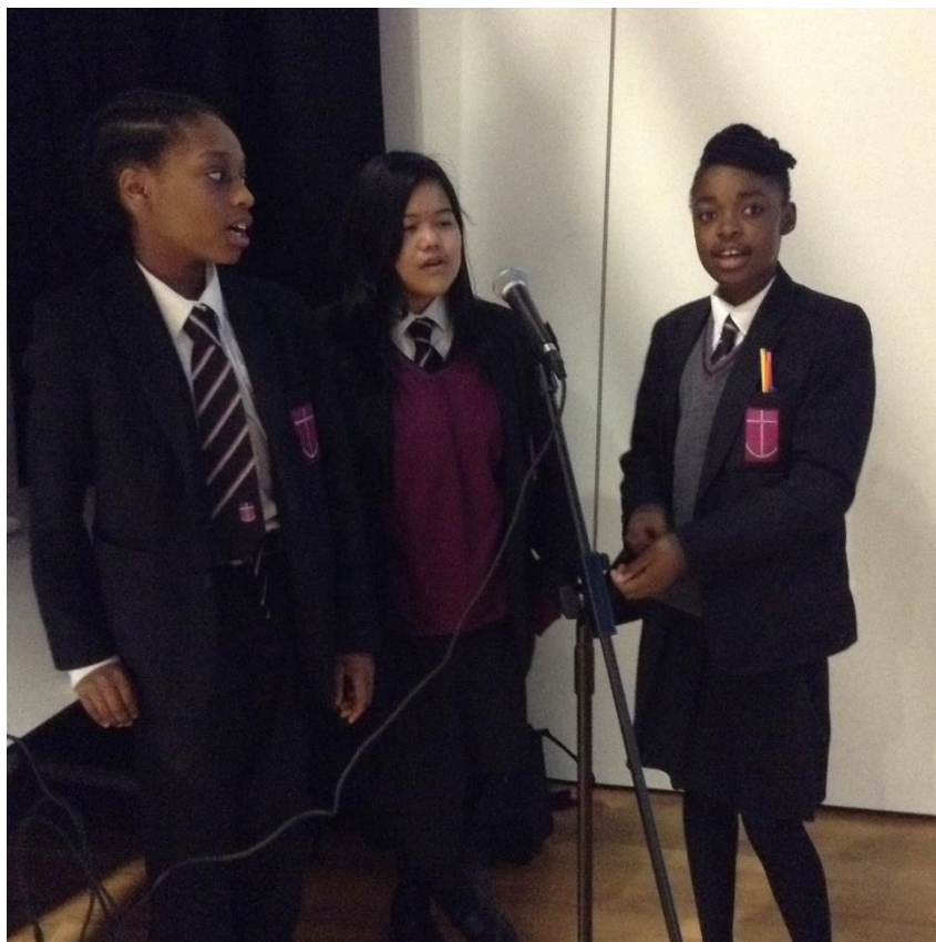
Students leading singing during Collective Worship