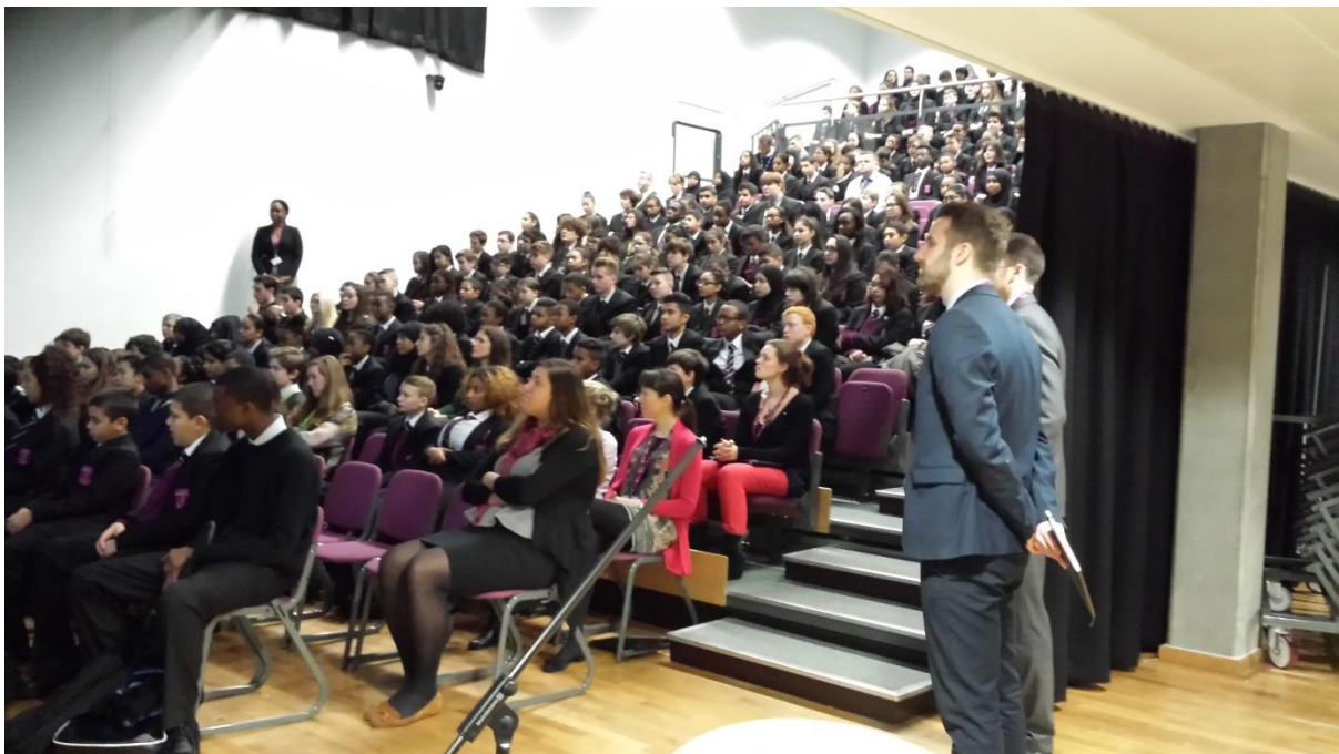
A Collective Worship Assembly for two of our Houses

We are fully inclusive and therefore welcome everyone, from all different backgrounds, who want an education informed by Christian values and beliefs. Although the Christian approach to living and learning is naturally prominent at the Academy, your child will develop proper regard for other faiths and belief systems, by learning about them and by exploring and debating faith, beliefs and values. Much of this will be explored in a dynamic Religious Education and Collective Worship programme (Assemblies, Coaching Time and Services) where your child will be stimulated and challenged to think deeply and widely.