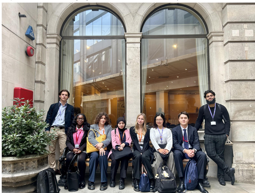
Year 12 Grocers' Award Competition Team.