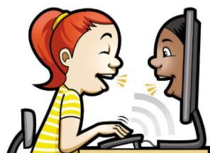
A Parent's Guide to Social Media