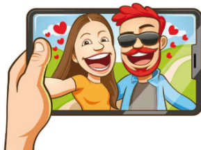
A Parent's Guide to Sharing Pictures