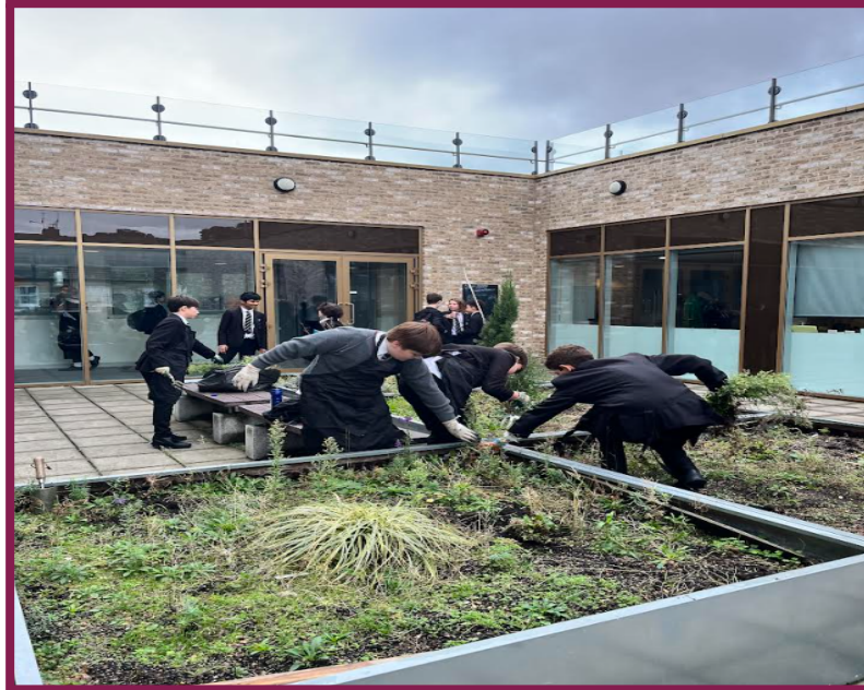
Our year 8 gardeners in full bloom!

Our end of year assembly was full of celebration and joy and I am sure you will hear all about our marvellous karaoke that followed on at lunchtime. This celebration really encapsulated Year 8 as a year group- always ready to join in with each other and always ready for a sing-song.