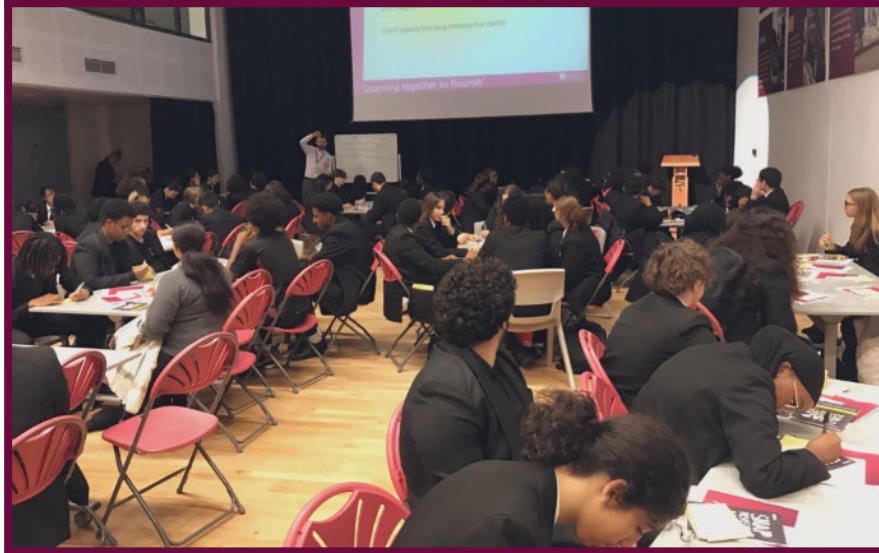
Study Skills Day, November 2023